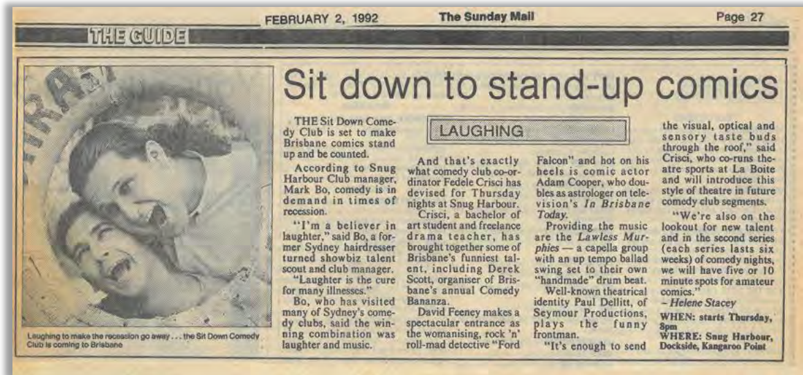
Sit Down...the beginning.